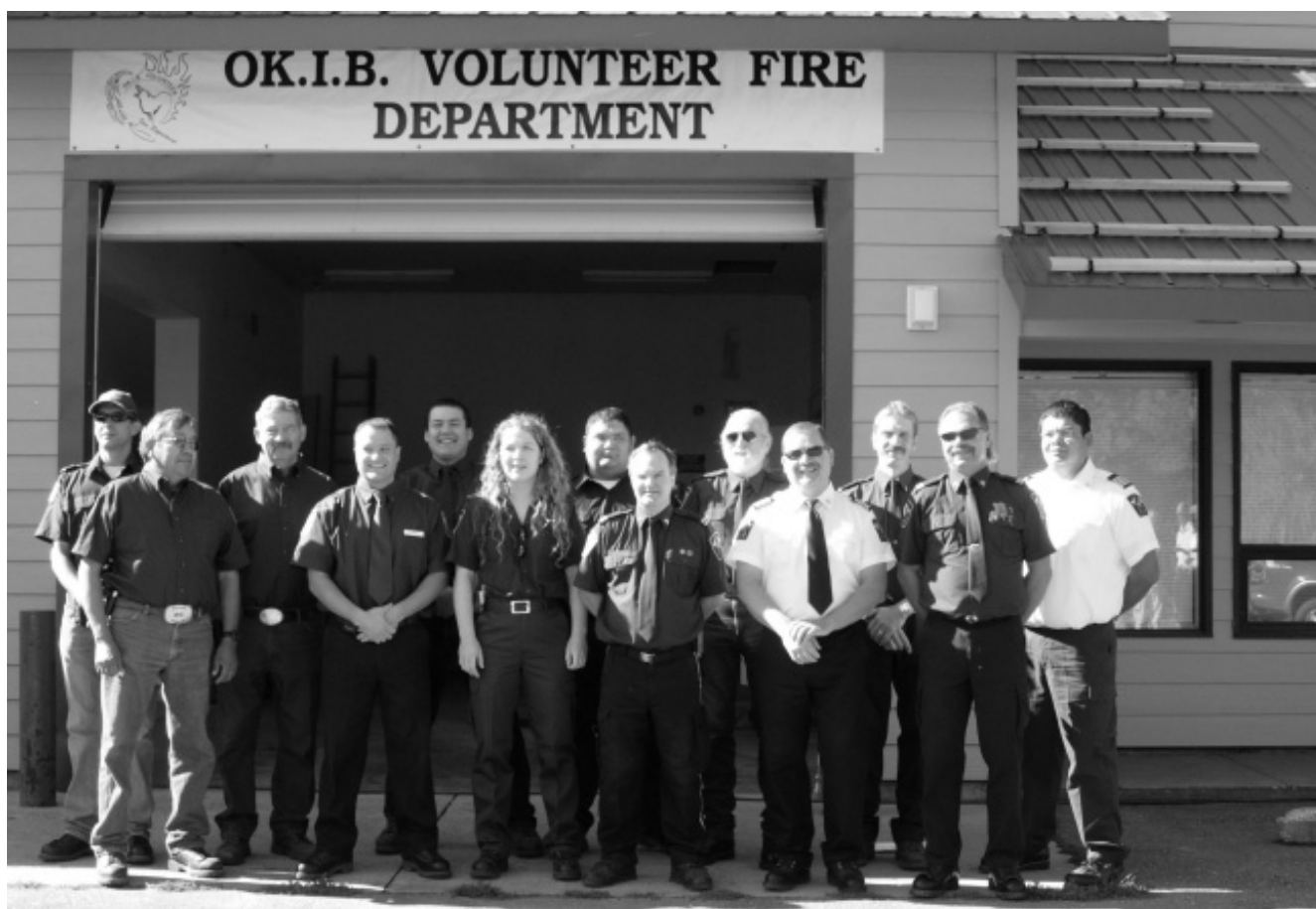
The Okanagan Indian Band Volunteer Fire Crew

The OKIB Volunteer Fire Department hosted the Grand Opening of their new fire hall and new fire truck on Sept. 17. The fire crew would like to thank all of those who made it out to the opening and the dinner.