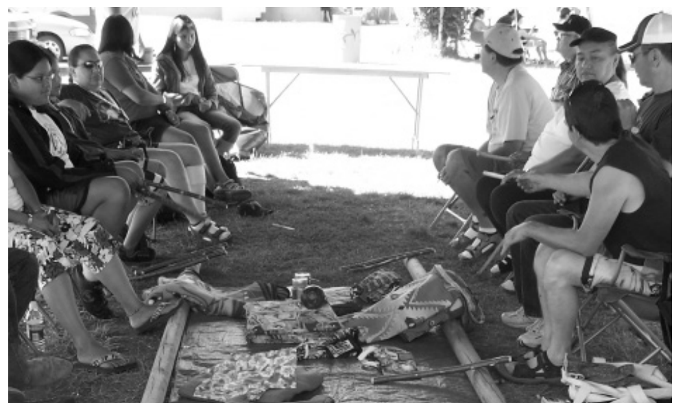
Stick gamers getting ready to play

The traditional stick game was a hit too. Some of the items won were: blankets, Pendleton vest, beaded earrings, wing dress, bag, pouch, rattle, canned fruit and salmon. No drums, rattles or money were used during play.