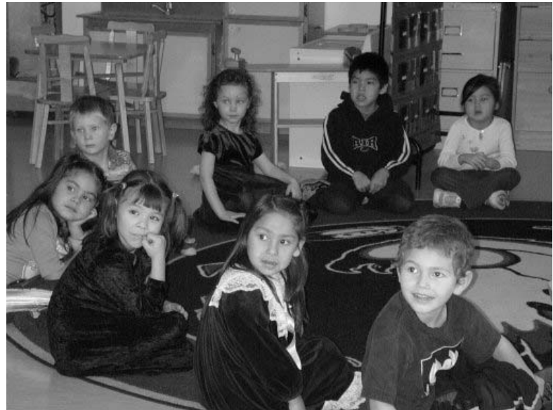
The Kindergarten class waits for Santa's arrival.