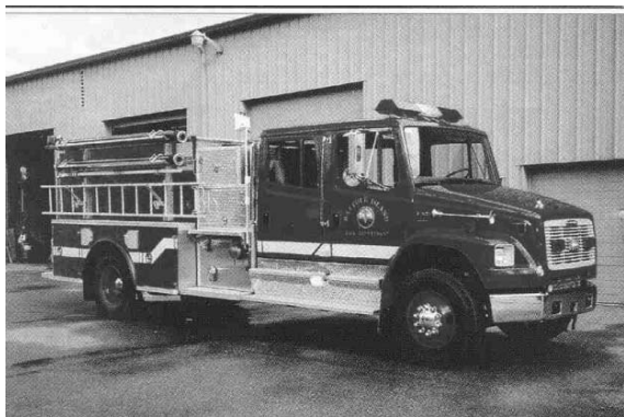
The OKIB will be acquiring a new fire truck similar to the one pictured above in the spring of 2005.